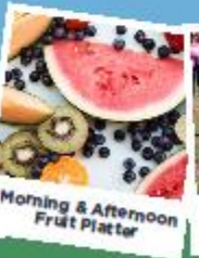
Morning & Afternoon Fruit Platter