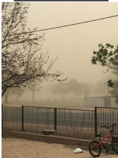
TULLAMORE CENTRAL SCHOOL THROUGH ONE OF THEIR REGULAR DUST STORMS