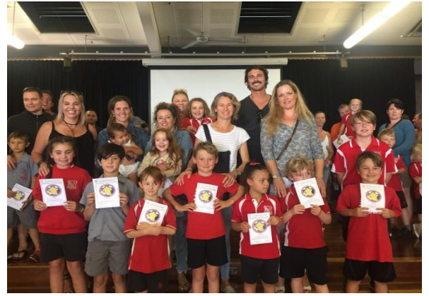
Congratulations to last Friday's Super Stellar recipients!